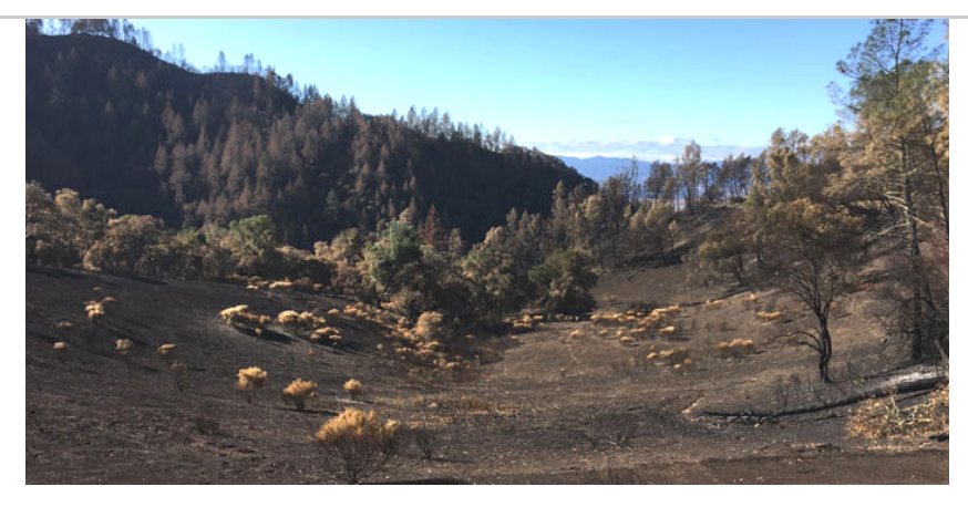
Bear Canyon Wildlands Preserve after the fire.

In the aftermath of another devasting wildfire, our hearts go out to all those affected and our thanks go out to the amazing first responders who helped keep us safe. Many people have asked how our conservation lands were affected by the fire. Sonoma Land Trust's preserves, White Rock and Bear Canyon Wildlands, burned entirely, but with some notable differences. At White Rock, it appears that the fire burned at a moderate intensity, though it was uneven; the fire charred grassland but the trees mostly survived, leaving a generally intact canopy. At Bear Canyon Wildlands, the fire burned with a higher intensity and severity, consuming the chaparral vegetation and blackening the pine forest along the ridgelines. During the fire, a bulldozer line was created to help contain the fire, so we are now focused on repairing this impact and controlling erosion. Neither of these two ecological preserves contained any structures. We believe that both preserves will recover naturally over the coming years and, going forward, we will work to monitor and respond to the conditions of the land as it recovers. Nature is resilient – and so is Sonoma County!