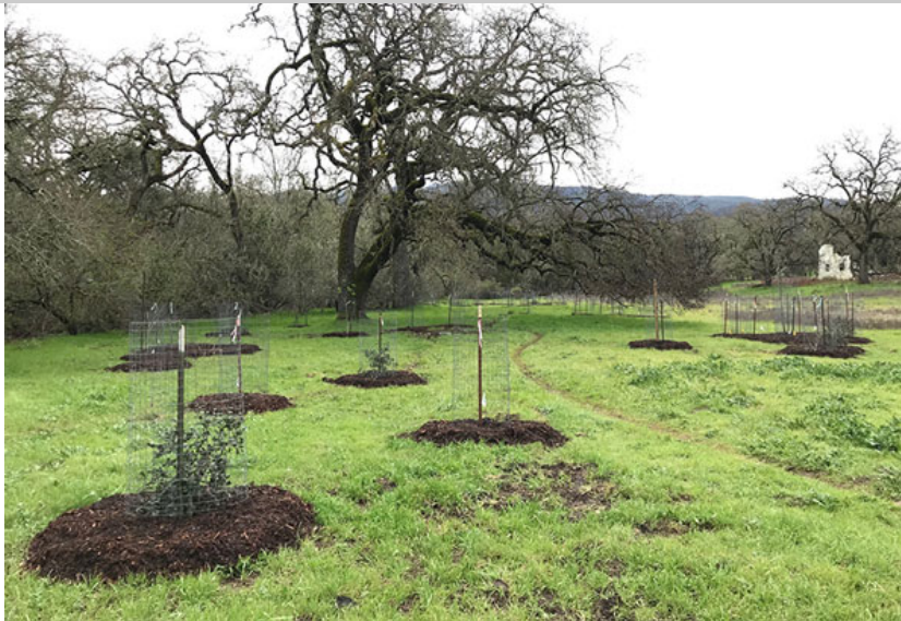
New plants on the south side of Stuart Creek. Note the burned stone barn in the background.

In 2016, Sonoma Land Trust began a riparian planting project on Stuart Creek at Glen Oaks Ranch — an important stretch of the Sonoma Valley Wildlife Corridor . We set out to plant 234 valley oaks, elderberry, coyote brush and other plants along the creek to provide food and nesting habitat for birds and create a buffer from human-made disturbances for animals like deer, bobcats and mountain lions who use the property to move across the valley. Not long after installing half the plants, the October 2017 Nuns Fire swept across the property, burning many of the new plants and melting the irrigation system. A year and a half later, we have replaced the burned plants, rebuilt the irrigation system and put in the remaining plants. A big thank you to our volunteers who helped protect those plants by installing 100 deer cages in early March, taking us over the finish line on a project that will improve wildlife habitat for decades to come.