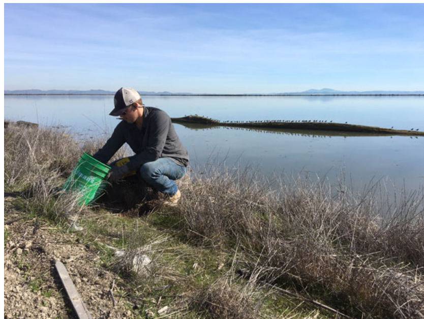
Contractors planting creeping wild rye along the shoreline at Sears Point Ranch.

The levee at Sears Point will eventually provide important habitat for marsh wildlife that require cover on the edge of the marsh during periods of extreme tides and storms. The parade of colorful 16-inch flags you may have seen flapping by the water line recently represent more than 4,000 individual grasses that our contractors at Pacific Watershed Associates planted over the past few weeks. The flags help us locate the grasses for watering and monitoring during this dry winter. All of the grasses were harvested from nearby naturally occurring populations with the enormous help of the San Pablo Bay National Wildlife Refuge staff and their backhoe, which reduced hours of backbreaking shovel work into less than hour of mechanical work. The new grasses complement growing populations of naturally colonizing pickleweed and cordgrass along the shoreline. It all points in the right direction for habitat development and is very encouraging. Come take a stroll and see it for yourself!