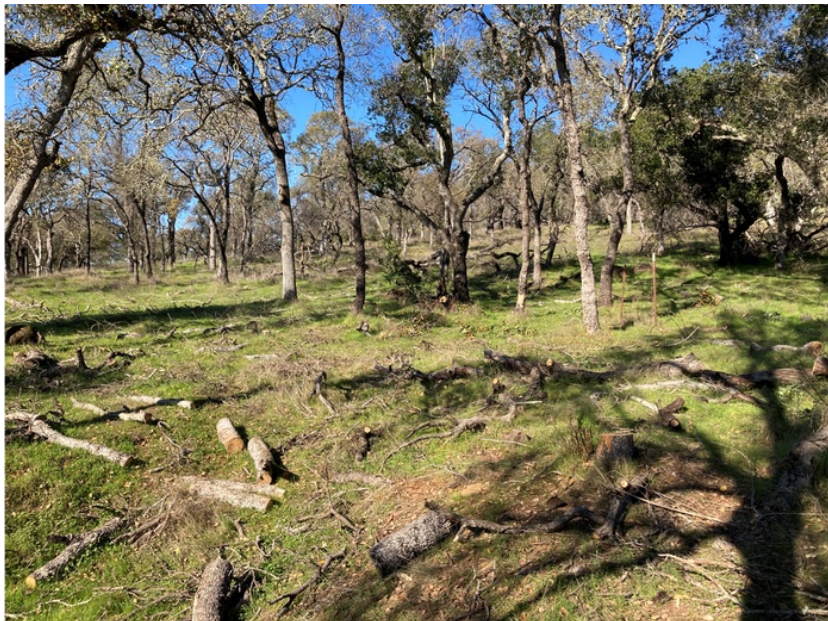
(Top) Before and after (bottom) vegetation thinning at Glen Oaks Ranch.

Circuit Rider's fuel reduction crew recently completed 10 acres of understory thinning on our Glen Oaks Ranch and Stuart Creek Hill preserves. Circuit Rider helped us with native plantings along Stuart Creek in 2005, so it was exciting to welcome them back to the land in this different capacity. Funded through the Sonoma Valley Wildlands Collaborative's CAL FIRE Fire Prevention Grant, this effort improves forest health, helps lower the intensity of future wildfires that may burn through the forest and prepares the land for the re-introduction of prescribed fire. The oak woodlands on both properties burned in the 2017 Nuns Fire with relatively minor impacts, but in the intervening years, we have noticed more tree mortality and, in particular, significant die-off from the lack of water this year. The crew felled and dispersed small diameter dead trees, trimmed resprouting bay and madrone, and limbed branches up off the ground.