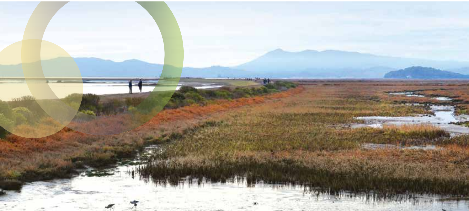
Passing Measure AA is critical for restoring more needed tidal marsh around the bay and providing outdoor recreation, as our project at Sears Point is doing.