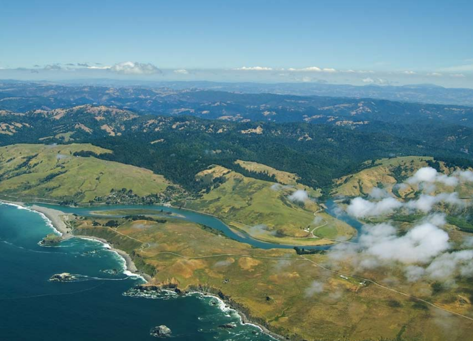
The Jenner Headlands is biologically rich, with 13 different habitat types, eight watersheds, 3,100 acres of redwood and Douglas fir forest, 1,500 acres of rare coastal prairie, and numerous threatened and endangered species.