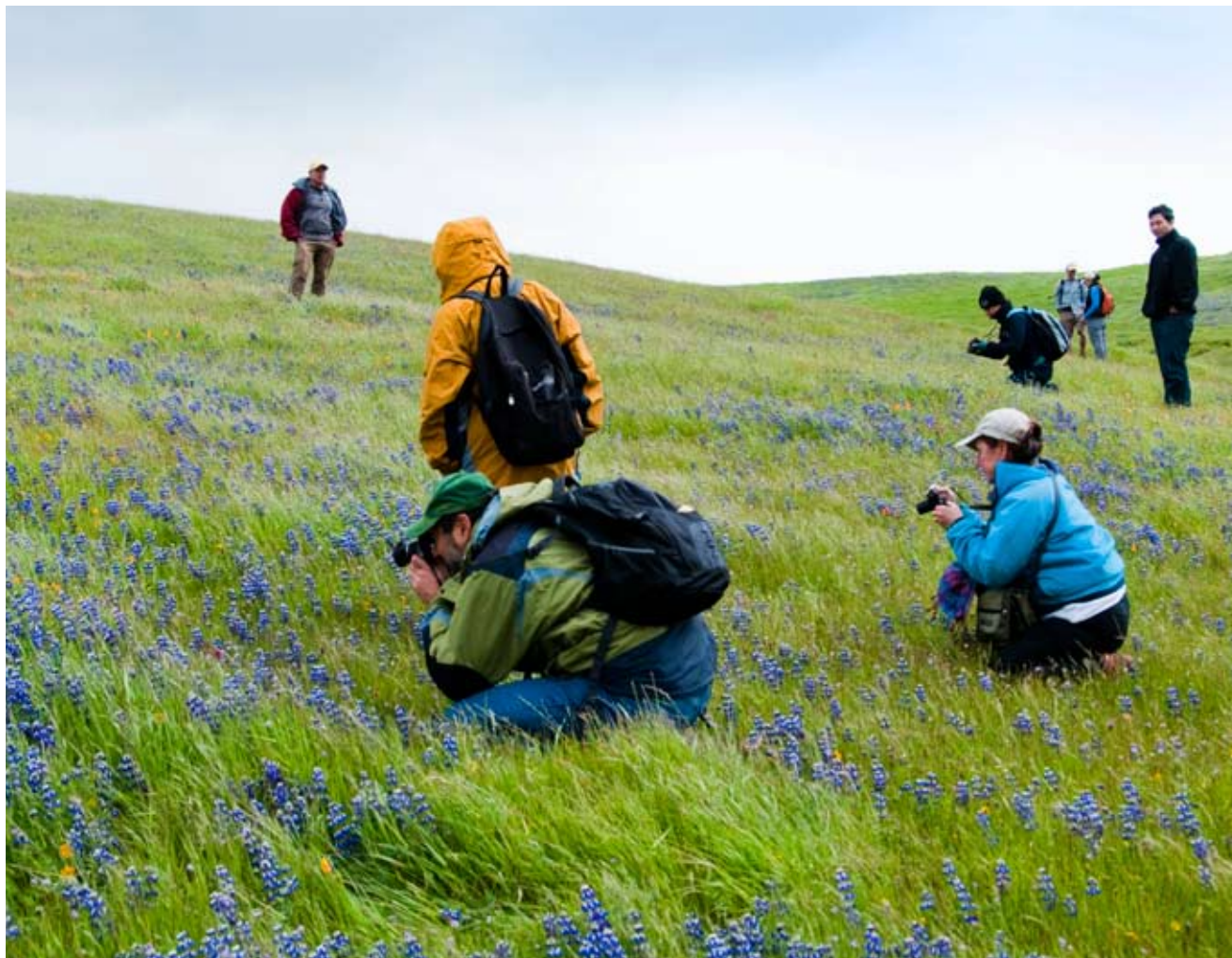
SLT’s spring wildflower hikes on Cougar Mountain in the Sonoma Baylands are always popular.

their own on the Bay Trail along San Pablo Bay, protected by the Sonoma Land Trust and now open to the public 365 days a year. The member hike series, a benefit of being a donor to the Land Trust, expanded from four hikes to six hikes per quarter to accommodate our expanding membership. Our workdays, which offer volunteers a hands-on stewardship experience with our unique properties, continue to grow in number as the number of protected properties increases, and we continue to welcome students from LandPaths’ IOOBY (In Our Own Backyard) program and the Student Conservation Association to our properties for restoration and education activities. Our land is hard at work performing many functions for us year round!