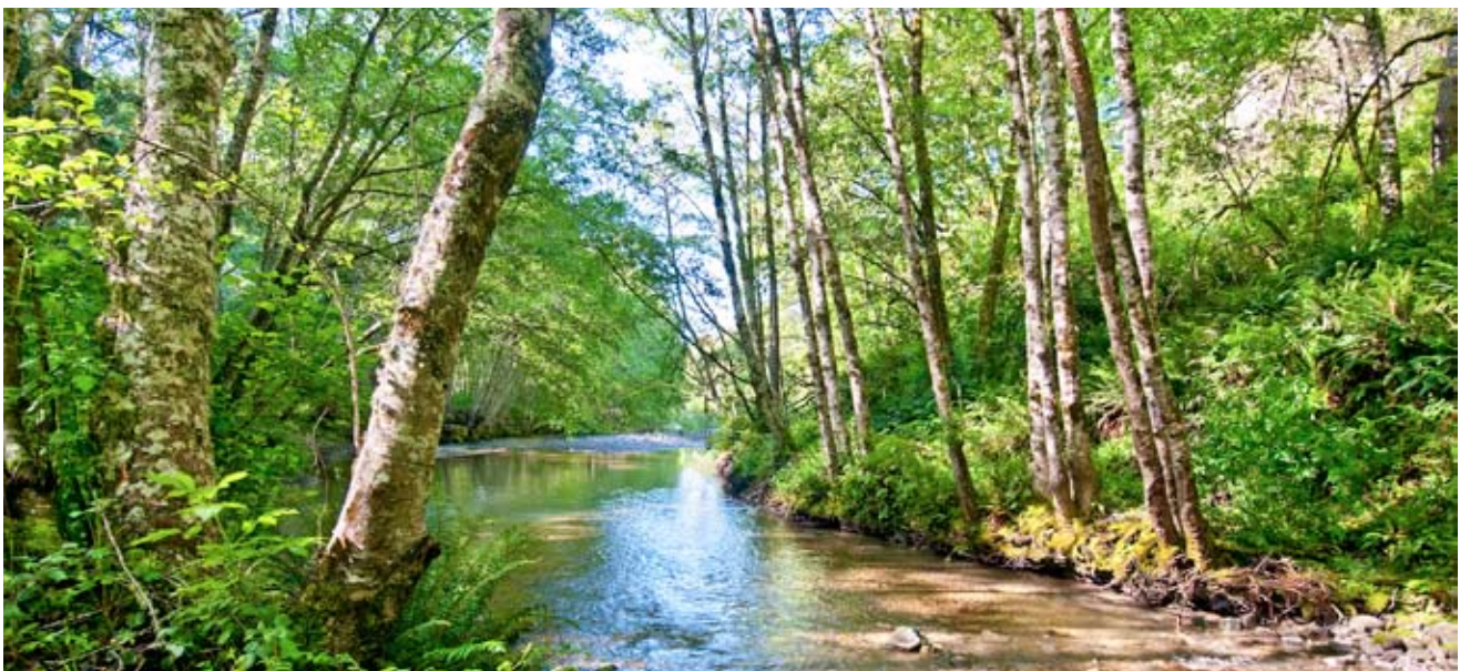
Historically, coho salmon made their way through Russian Gulch on the Jenner Headlands — and may do so again.

Once the plan is finished, title to the Jenner Headlands will be transferred to The Wildlands Conservancy with the intent of ongoing management collaboration. In the meanwhile, the public is enjoying unprecedented opportunities to experience the Jenner Headlands through guided hikes led by the Sonoma Land Trust, The Wildlands Conservancy and our other partners — the Sonoma County Agricultural Preservation and Open Space District, Stewards of the Coast and Redwoods, Coastwalk, California Native Plant Society and LandPaths.