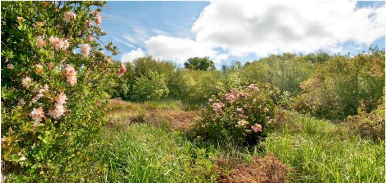
Azaleas in springtime bloom at Pitkin Marsh.